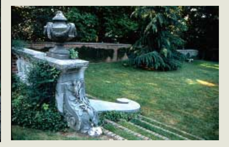
11.34. Railing designed by Farrand, Rock Creek Park overlook, Dumbarton Oaks