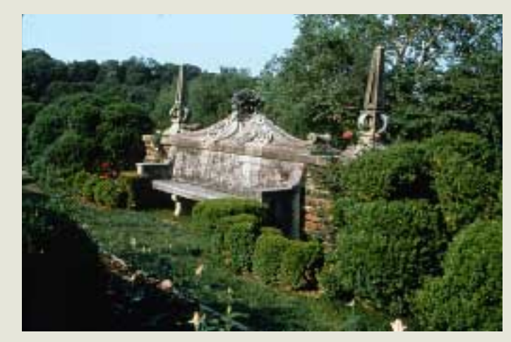
11.32. Rose Terrace bench, Dumbarton Oaks

The elegant simplicity and restraint inherent in Farrand's work, as well as her ability to amalgamate her European and Arts and Crafts sources into an original design, is also apparent as one follows the garden's gently spiraling plan through the orchard and herbaceous border, enters the Box Walk leading to the Ellipse, then returns on this straight path past the Tennis Court and Swimming Pool to the North Court. Here her skill in orchestrating garden space is seen once more in the series of grassy terraces leading to an overlook revealing the wild natural scenery of Rock Creek below (fig. 11.34). Now a public park, this section was planted by Farrand to enhance its character as a nature preserve. Steps, paths, benches, and a stone bridge facilitated and poeticized excursions into this section of the garden.