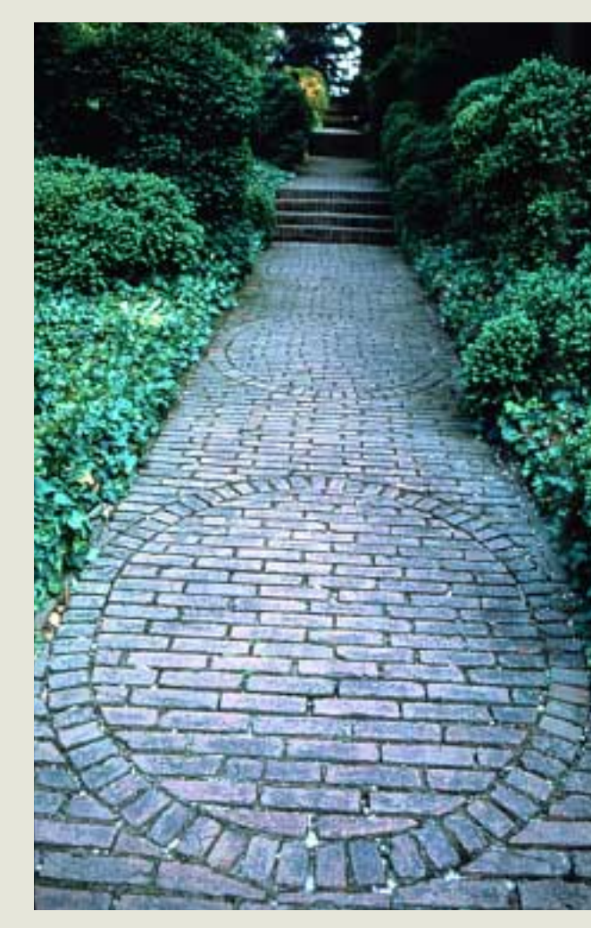
11.33. The Box Walk, an ivy- and boxwood-bordered brick path, Dumbarton Oaks

Shrub plantings along the R Street rand's most charming conceits, a small outfrontage partially screen the lawn sweeping up to the front of the house, ensuring a degree of privacy. A large orangery off the east wing provides an effective transition between the house and the first of a series of outdoor rooms, the Beech Terrace, named for its central feature, a massive purple beech tree. As one descends to the Urn Terrace and, below it, to the Rose Terrace, then drops yet another level to the Fountain Terrace, one appreciates Farrand's eye for proportion, line, and detail (figs. 11.30, 11.31, 11.32). Her artistry appears in the scale of stairs and their finial and urn-punctuated piers, the deft interplay between straight and curving elements, and the contrasting textures of the carefully articulated ground plane with its finely crafted paving materials, grass, and planting beds (fig. 11.33). Below the Fountain Terrace, hidden from view, is one of Far-